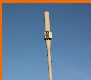
Supporting Scottish Futures Trust to deliver the Infralink Programme