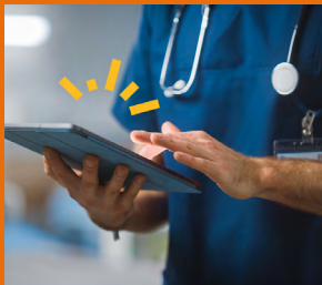
Enhancing Mobile Connectivity at Dumfries and Galloway Royal Infirmary

At FarrPoint, we help local authorities unlock the potential of their urban environments to support improved mobile connectivity.