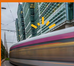
Strategic Connectivity Analysis for West Midlands 5G Metro